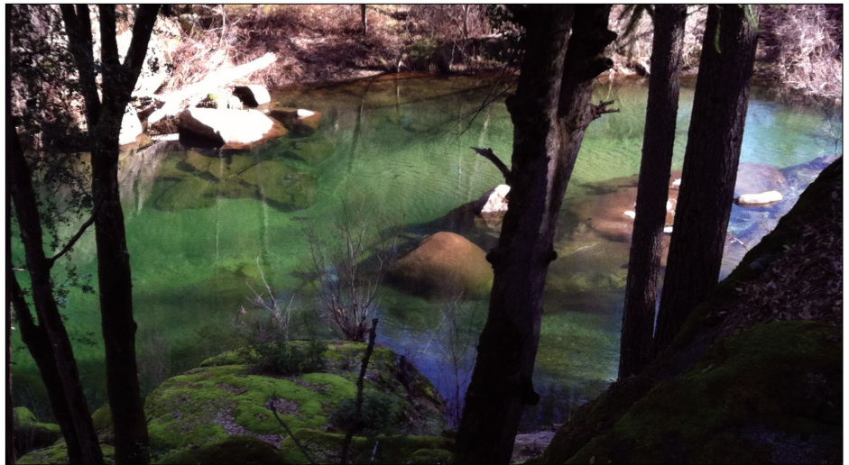
Water for the Outingdale service area is diverted from the Middle Fork Cosumnes River

The information provided in this report is required by law to be issued to every water user. Property owners: please share this information with your tenants.