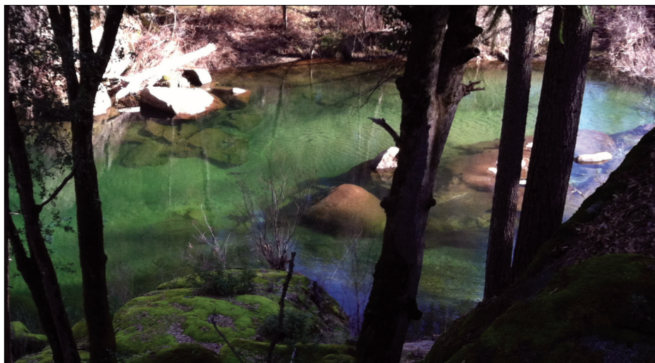
Water for the Outingdale service area is diverted from the Middle Fork Cosumnes River

The information provided in this report is required by law to be issued to every water user. Property owners: please share this information with your tenants.