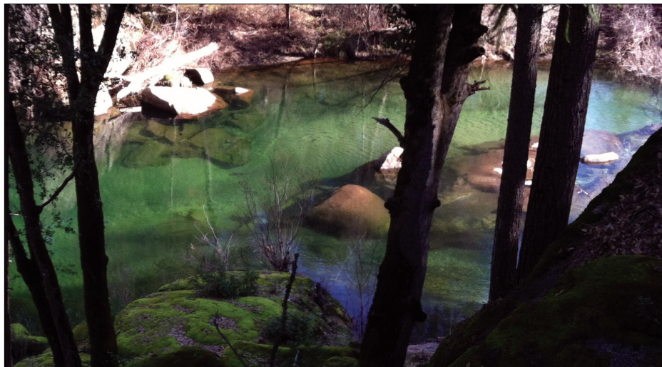
Water for the Outingdale service area is diverted from the Middle Fork Cosumnes River

The information provided in this report is required by law to be issued to every water user. Property owners: please share this information with your tenants.