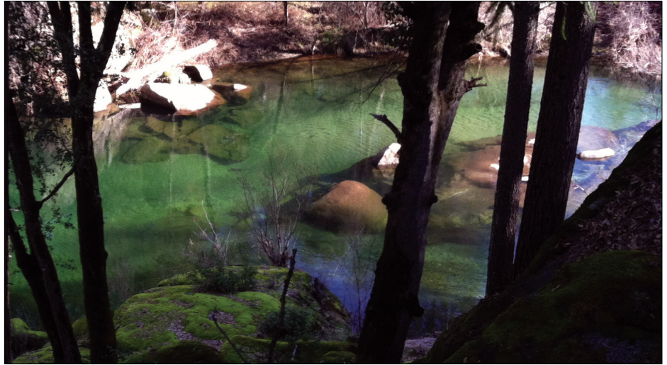
Water for the Outingdale service area is diverted from the Middle Fork Cosumnes River

The El Dorado Irrigation District Board of Directors meetings are open to the public and are held on the second and fourth Mondays of each month. Meetings begin at 9:00 A.M. in the Placerville headquarters building at 2890 Mosquito Road. Go to the District website at www.eid.org to learn more.