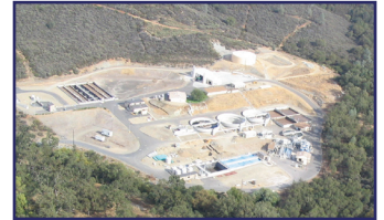
Aerial view of Deer Creek wastewater treatment plant

The agreement, which took seven years to reach, resets Regional Board guidelines on the treatment of copper at EID's Deer Creek wastewater treatment plant. Without the agreement—based on extensive scientific research that showed the low levels of copper in the treated wastewater pose no harm to aquatic life—EID would have needed to significantly change its treatment process at the plant.