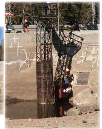
EID crews at work on the Silver Lake dam restoration project