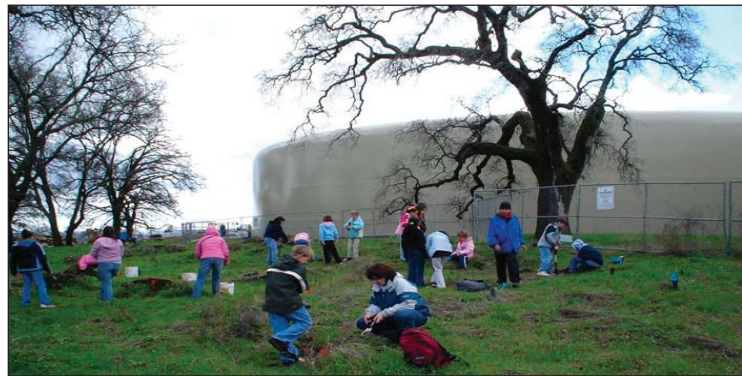
Green Valley Elementary School students plant native plants and shrubs at EID's Bass Lake tanks site in El Dorado Hills

El Dorado Irrigation District (EID), along with the American River Conservancy (ARC) and Green Valley Elementary School, joined forces to host a children's environmental awareness program involving approximately 240 second and fifth grade students. During the winter and spring months, Green Valley Elementary School students learned about their local ecosystem through the "NEST" (Nature Exploring for Students and Teachers) program that focused on watershed, habitat, and native plants and animals. The culminating event was a field trip to the site of EID's two 4 million-gallon Bass Lake tanks, where they planted native trees and shrubs. The project was developed by EID as a method to meet the project's California Environmental Quality Act (CEQA) mitigation requirements.