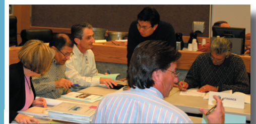
EID staff participating in mock emergency

Although it's not time to put away your warm jackets, you can start planning your summer outings.