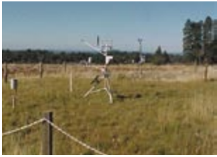
CIMIS station near Camino

The District is currently monitoring the soil moisture condition of approximately 300 field sites with neutron probes and tensiometers. Sites are read weekly during the irrigation season, and an individualized computer printout is sent to each grower the following day. The printout indicates the soil moisture status, predicts the next scheduling and recommends the amount of water to apply to each field.