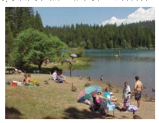
Sly Park visitors enjoy a variety of activities at the park's Jenkinson Lake.

Now that the model has been developed, the District envisions using it in the future to help ensure that the quality of water from Jenkinson Lake remains "excellent and sterling."