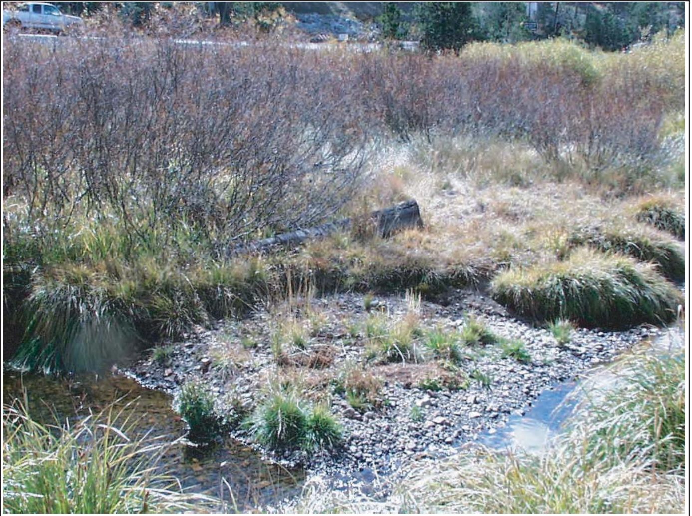
Across Creek near Hwy 88

El Dorado Irrigation District FERC Project # 184 El Dorado County, CA